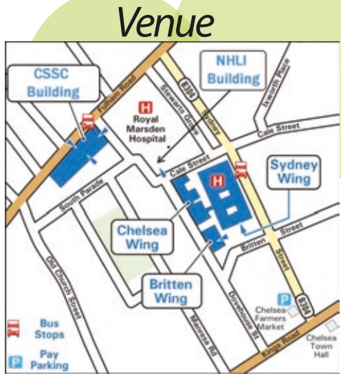
Clinical Skills and Simulation Centre, Royal Brompton Hospital, South Parade, London SW3 6LL

Formative feedback will be provided having collected real-time assessment data, in order to inform immediate formative feedback to learners.